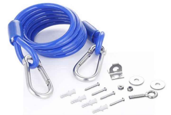
Restraining Cable Kit