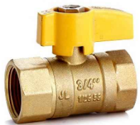
Full Port Valve