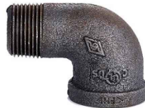
90° Street Elbow 2 pieces included