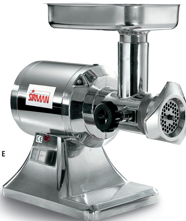
TC 12-22 E