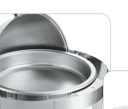
Cover Stays Open at 90^{\circ}