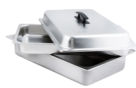
Full Size Water Pan & GN Food Pan & Cover