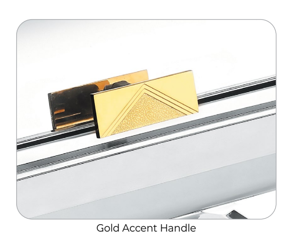
CAFR-WP CAFR-401CR CAFR-FH