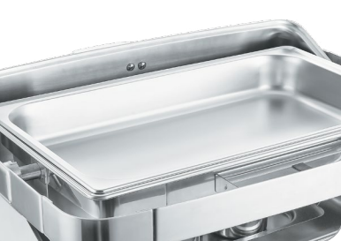
180° Opening Roll-Top Cover