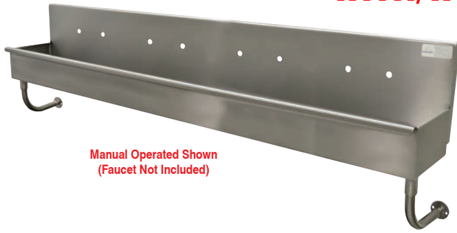
Manual Operated Shown (Faucet Not Included)