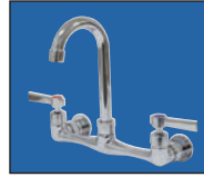
"-F" Series Sink Includes K-159 Gooseneck Faucets