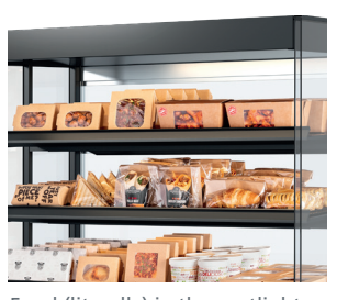
Food (literally) in the spotlights -LED lighting above each shelf.