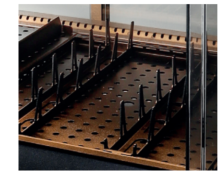
Wide range of accessories