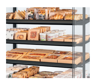
Ultimate product visibility transparent design, thin shelves, no distraction.