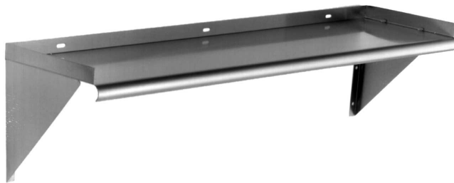
wall shelf with tab lock

Eagle Tab Lock Wall Shelf, model _____. Constructed of 16 gauge type 430 stainless steel, with 1½" roll on front and 1½" upturn on rear and ends. Stainless steel mounting brackets with tab lock for easy assembly.