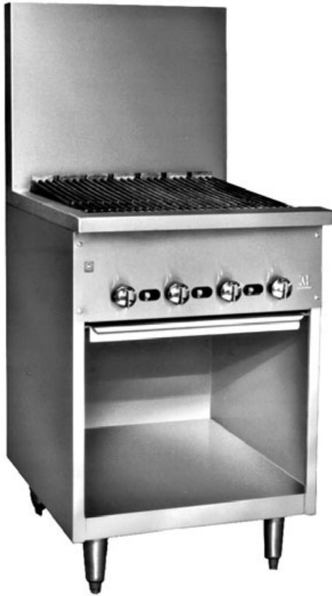
JBR-24B with optional high riser