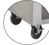
Optional TA-255P Casters Available