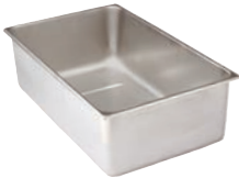
SP-A - Spillage Pan

Visit our website for additional Food Table Accessories