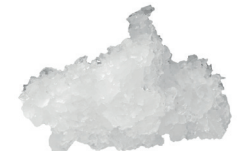
FLAKE ICE 85% ICE HARDNESS FACTOR