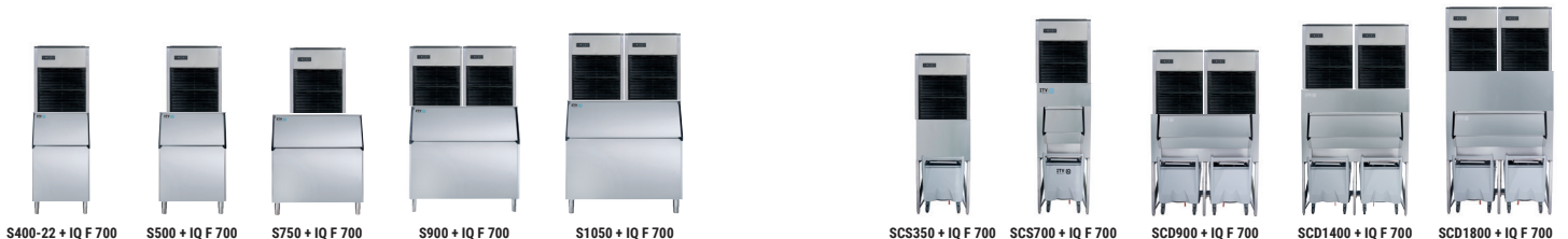
S400-22 + IQ F 700