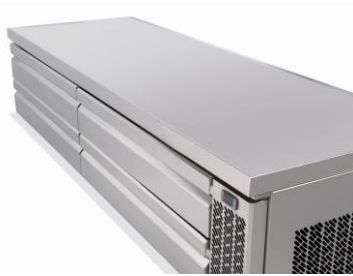
AISI 304 Stainless Steel worktop with drip guard marine edge, standard.