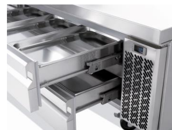
Heavy-duty stainless-steel drawer slides designed to hold up to 440 Lbs. (Pans Not Included)