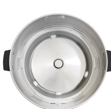
Sheathed Double Heating Coil