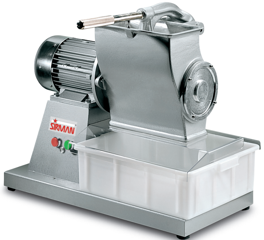
GF Hp 4