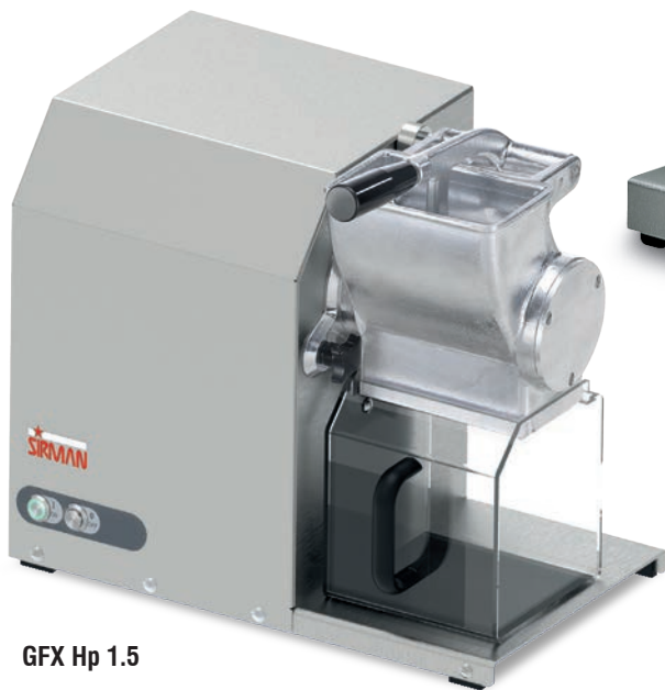
GFX Hp 1.5

Certified to UL Standard 763 Certified to CSA Standard C22.2