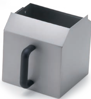
GFX Hp 1.5 and Hp 2 Optional s/steel tray