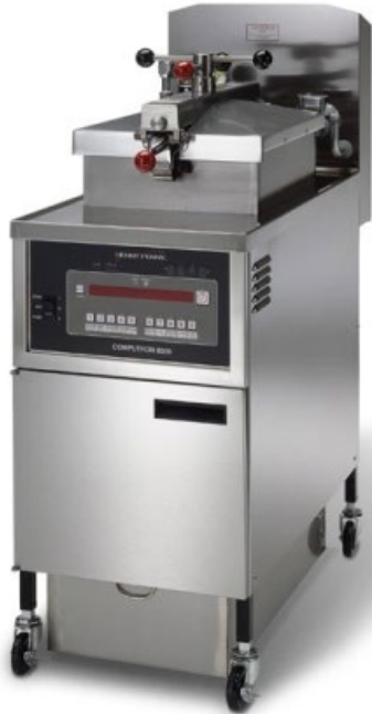
PFE 500 electric pressure fryer with Computron™ 8000 control

Henny Penny first introduced commercial pressure frying to the foodservice industry more than 50 years ago. Frying under pressure enables lower cooking temperatures for longer oil life, and faster cooking times to meet peak demand. Pressure also seals in food's natural juices and reduces the amount of oil absorbed into product.