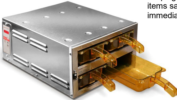
MPC 22 modular multi-purpose holding cabinet

Henny Penny multi-purpose holding cabinets are ideal for keeping small quantities of hot menu items safe, appetizing and ready for immediate serving or packing.