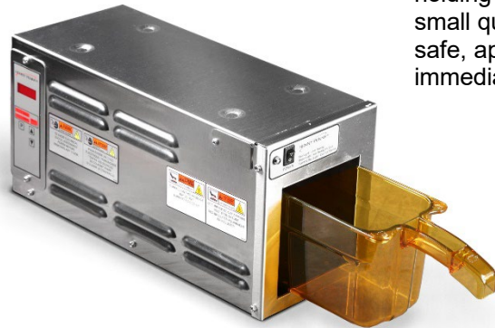
MPC 1L modular multi-purpose holding cabinet

Henny Penny multi-purpose holding cabinets are ideal for keeping small quantities of hot menu items safe, appetizing and ready for immediate serving or packing.